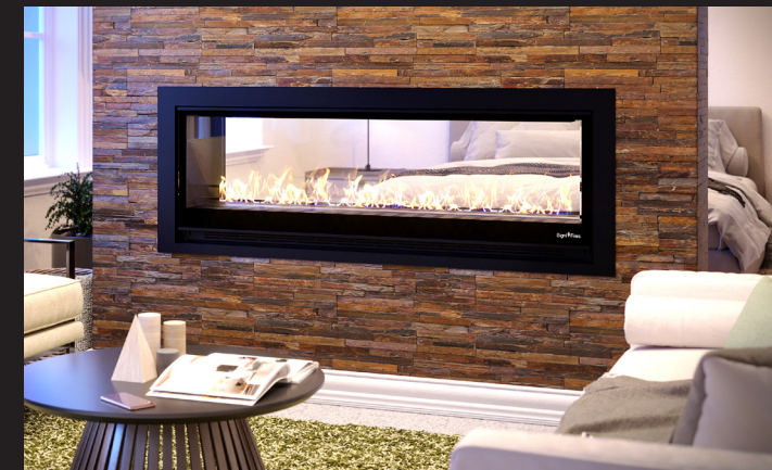
ELEMENT 160 / Double sided