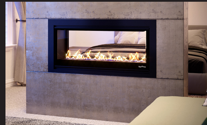
ELEMENT 120 / Double sided