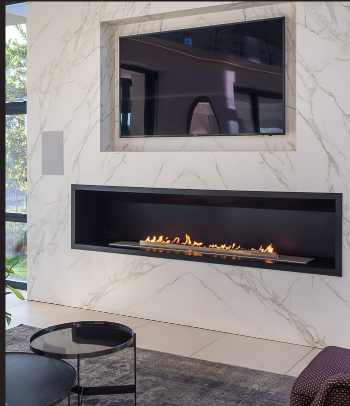
SINGLE SIDED FIREBOX