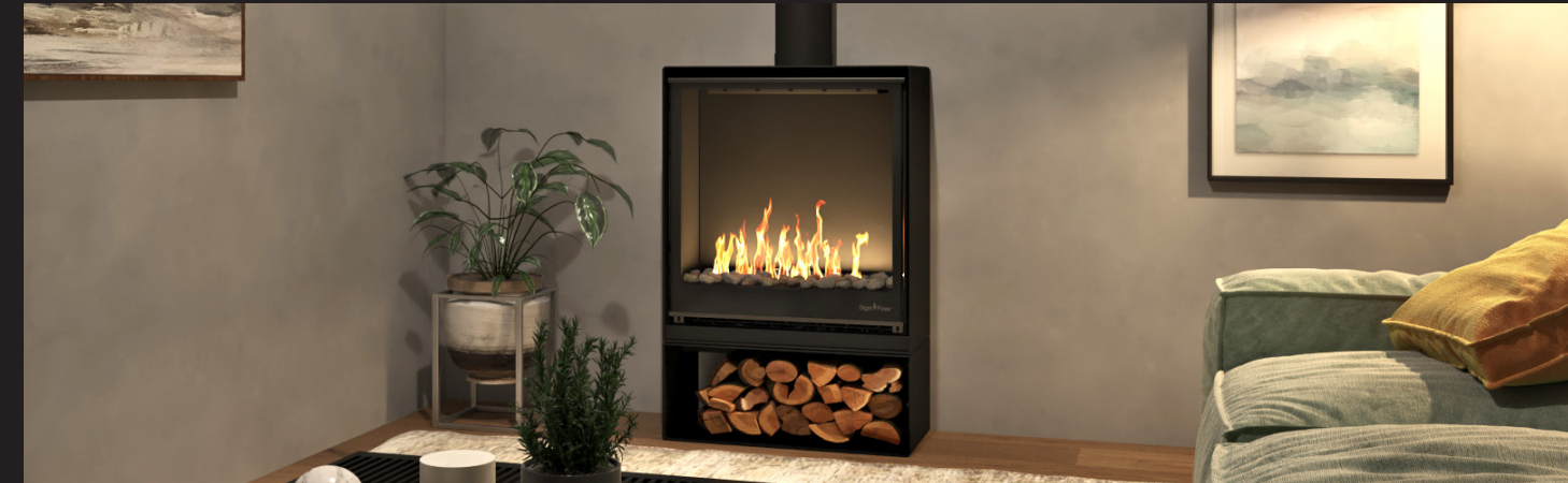
ELEMENT 80 / Free standing