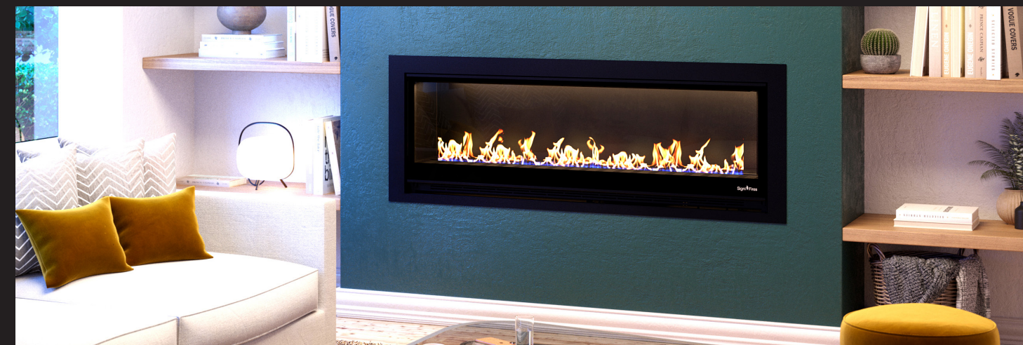
ELEMENT 160 / Single sided