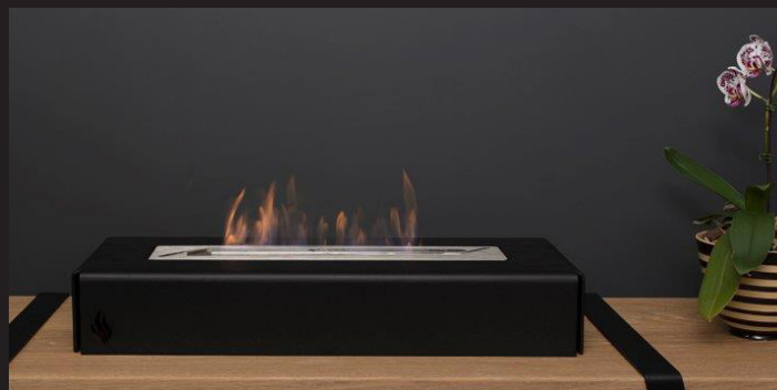
FOLD 500 / 800 / 1100 / 1400 Black / White / Stainless