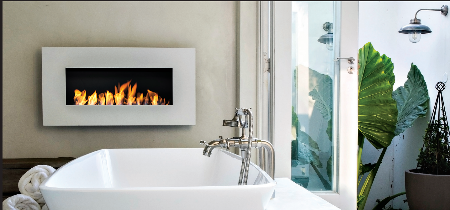
FRAME 1150 / 1450 / 1750 Black / White / Stainless steel