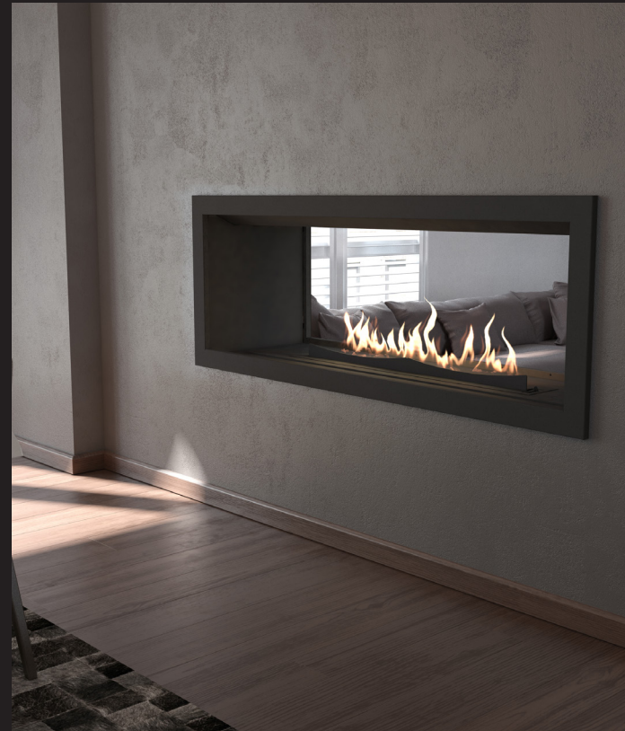
DOUBLE SIDED FIREBOX